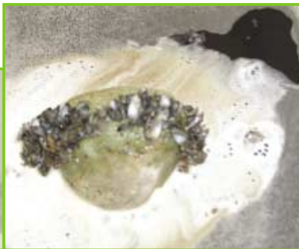
30 minutes later after using RYDLYME Marine