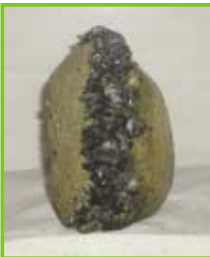
Before using RYDLYME Marine